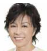
YUKARI SATO State Minister for Internal Affairs and Communications