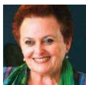
YAFFA BEN ARI Ambassador, Embassy of Israel in Japan