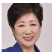
YURIKO KOIKE Governor of Tokyo