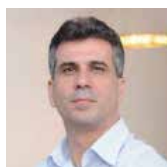
ELI COHEN Minister of Economy and Industry, Israel