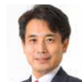
HIROFUMI TAKINAMI Parliamentary Vice-Minister of Economy, Trade and Industry